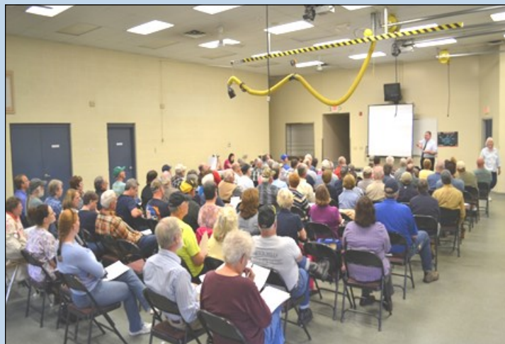
Private water supply owners attend a water test interpretation workshop in Lock Haven, PA sponsored by Headwaters RC&D, Clearfield Conservation District, the Colcom Foundation and the Pennsylvania Master Well Owner Network.

Since its inception in 2004, the Master Well Owner network has now provided direct consultation to over 30,000 private water supply owners while reaching another 100,000 through newsletters and mailings. Thanks to all of the volunteers, extension educators and project partners who continue to make MWON a successful program in Pennsylvania!